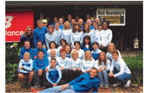
The Dick Beardsley Marathon Running Camp

© 2001–2011 Rainbow Resort, Inc. All Rights Reserved. RAINBOW RESORT, Aanii, WEST ITASCA, POLE PEDAL PANT & RAINBOW RENDEZVOUS are registered US Trademarks & AUNT AMY, FINDING RAINBOW, NORDIC POLE PEDAL PANT & LARENTIAN DIVIDE CHALLENGE are trademarks of RAINBOW RESORT, INC.